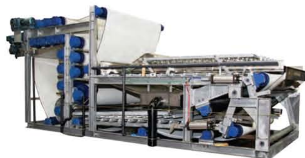
The Regent™ Press 15 Roll offers the same features as the Tower Press, but with increased cake solids.

Our pneumatic Belt Tensioning maintains consistent and even tension on the belt at all times for smooth operation and long belt life.