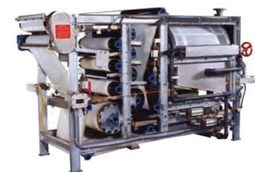
The Model TP7.4 Tower™ Press uses a drum instead of a gravity deck to minimize its footprint. This provides smaller plants with the same high performance dewatering results as larger presses, but for almost half the cost.